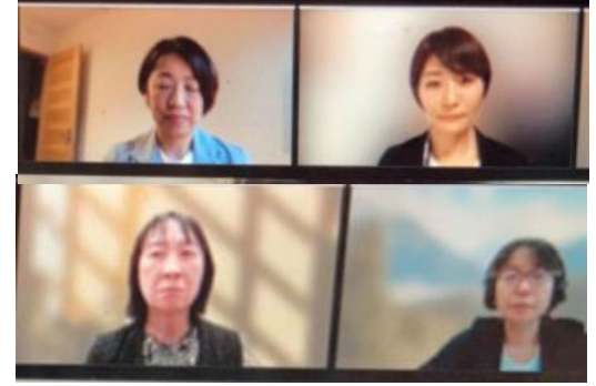
Symposium in the conference